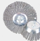
NYALOX BRUSHES 80 GRIT