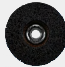
RAPID STRIP DISC