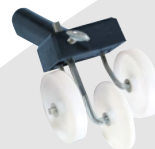
BACKER ROD TOOL