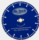
REMOVAL CLEANOUT BLADE