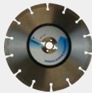
SEGMENTED DIAMOND BLADE